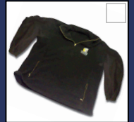
Fleece Top - R280