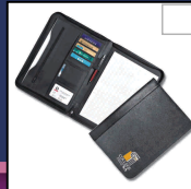
Folder - R90