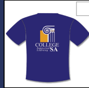
T-Shirt - R80