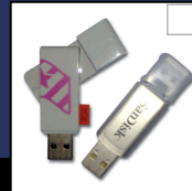
2Gig Flash Disk - R350