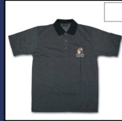
Golf Shirt - R160