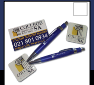
Smalls - R60