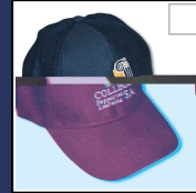
Cap - R60